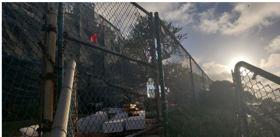
Photo taken 3/6/2021 during construction showing a locked public access gate to the public path.