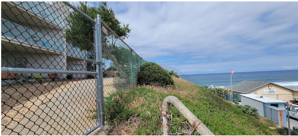
Photo taken 5/20/2024 showing a locked public access gate to the public path.