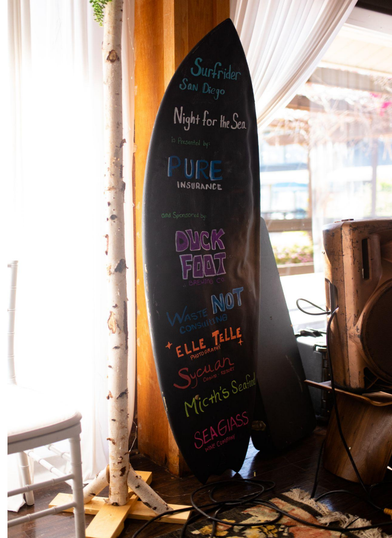
Surfboard Event Sponsor Signage